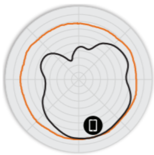
Figure 2. C110 2.4GHz Azimuth Antenna Patterns