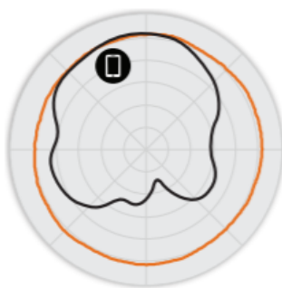
Figure 3. C110 5GHz Azimuth Antenna Patterns